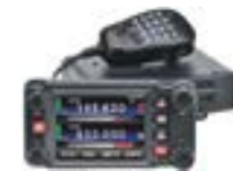
FTM-400XD 2M/440 Mobile