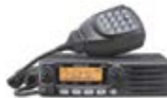
TM-281A 2 Mtr Mobile